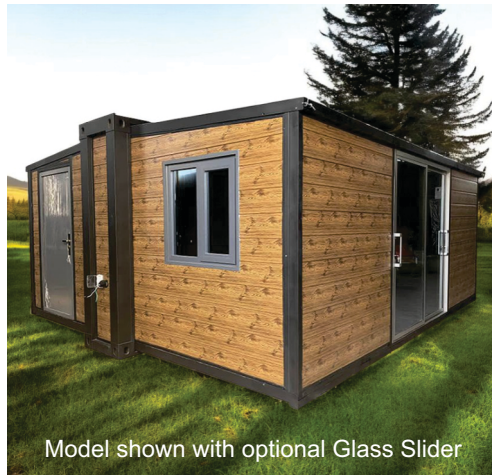
Model shown with optional Glass Slider