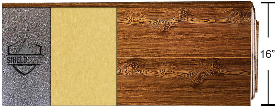
Available in 20-foot lengths