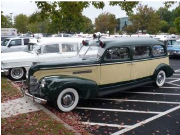
1940 Flxible-Buick owned by Paul Vickery