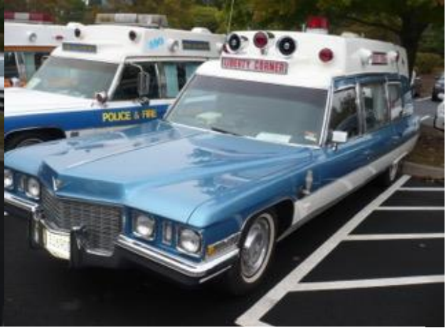
1972 Superior-Cadillac owned by Liberty Corners First Aid