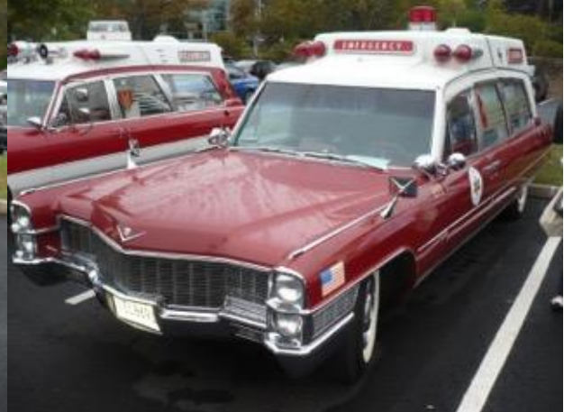
1965 Superior-Cadillac owned by Elberon First Aid