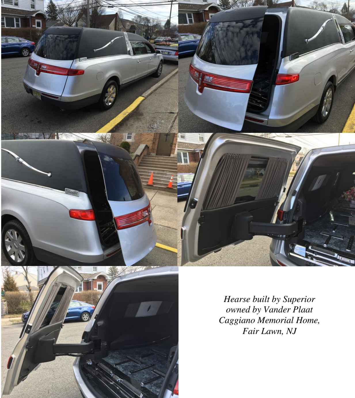
Hearse built by Superior owned by Vander Plaat Caggiano Memorial Home, Fair Lawn, NJ

When the demand for funeral livery is more than we have on hand, we turn to other funeral homes in the area for cars. Many of my colleagues in funeral service have chosen Lincoln Professional Cars over Cadillac. Built on the Lincoln MKT chassis, the hearses come with three different rear door configurations. On the hearse owned by Vander Plaat Caggiano Memorial Home in Fair Lawn, NJ, built by Superior, the entire rear pops opens with the press of the button located in the center of the bumper, above the license plate. The door then swings out and around to the side of the car on a very elaborate set of hinges. Although this moves the door completely out of the way for ease of access, the operation of the door can seem quite complicated.