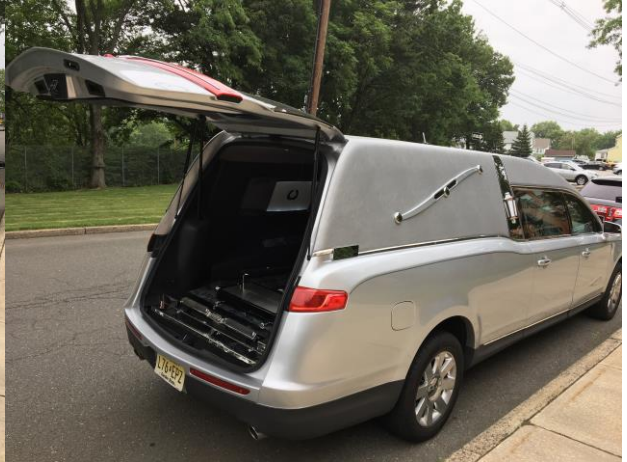
Hearse built by Superior owned by Nazare Memorial Home, Lyndhurst, NJ