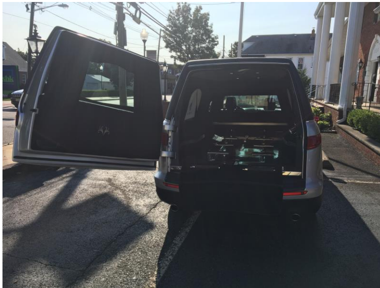
Hearse built by Federal owned by Shook's Cedar Grove Funeral Home, Cedar Grove, NJ