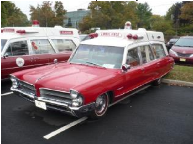
1965 Superior-Pontiac owned by Rich Litton