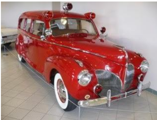
This beautiful 1941 Lincoln ambulance, coach builder unknown, greeted us as we entered the front lobby of the AACA Museum in Hershey, PA.

Newsletter of the NORTHEAST CHAPTER of the PROFESSIONAL CAR SOCIETY