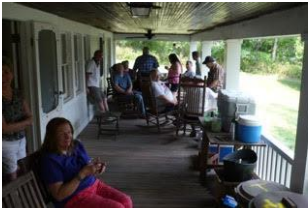
Northeast Chapter members having a great time on the porch