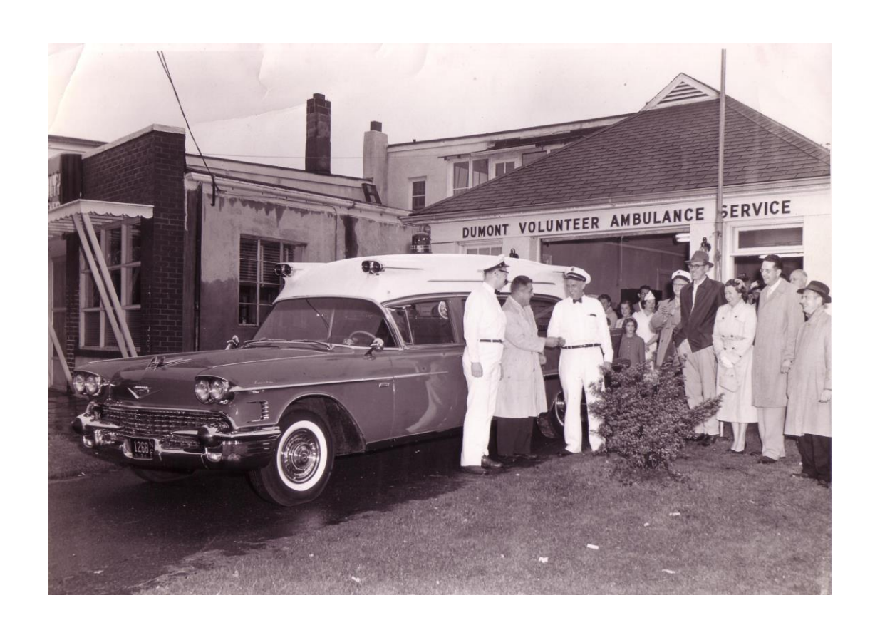
The Corps 4<sup>th</sup> rig was a 1958 Cadillac purchased new and dedicated on May 24, 1958. The exterior color was white over red. Unfortunately, details about that unit and additional photos have been lost.