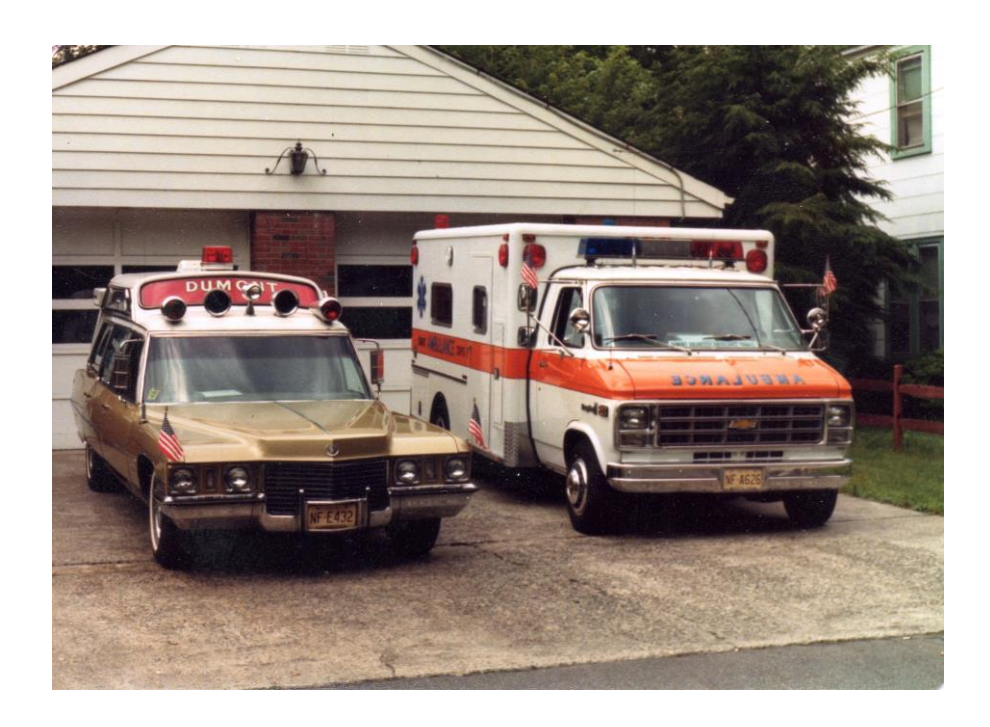
The Dumont Ambulance Corps was at a transition point in May 1978 when car-type ambulances were yielding to the newly designed box-type ambulances. This is believed to be the last photo of the DVAC's 1972 Cadillac ambulance.

The 1972 Cadillac ambulance stayed in service through 1979. Due to advances in Emergency Medicine there was much attention focused nationally on ambulances and new vehicle standards were issued by the Federal Department of Highway Safety. Many members had received advanced training as Emergency Medical Technicians during the mid and late 1970s and they needed more working room. Portable technology was also advancing such as heart monitors and radio links to hospitals, equipment that was difficult to fit into car-type ambulances. Thusly, after 43 years of providing the backbone of the Dumont Ambulance Corps and helping to save many lives, starting in 1975 the car ambulances were replaced by the now familiar box-type ambulance on a truck chassis.