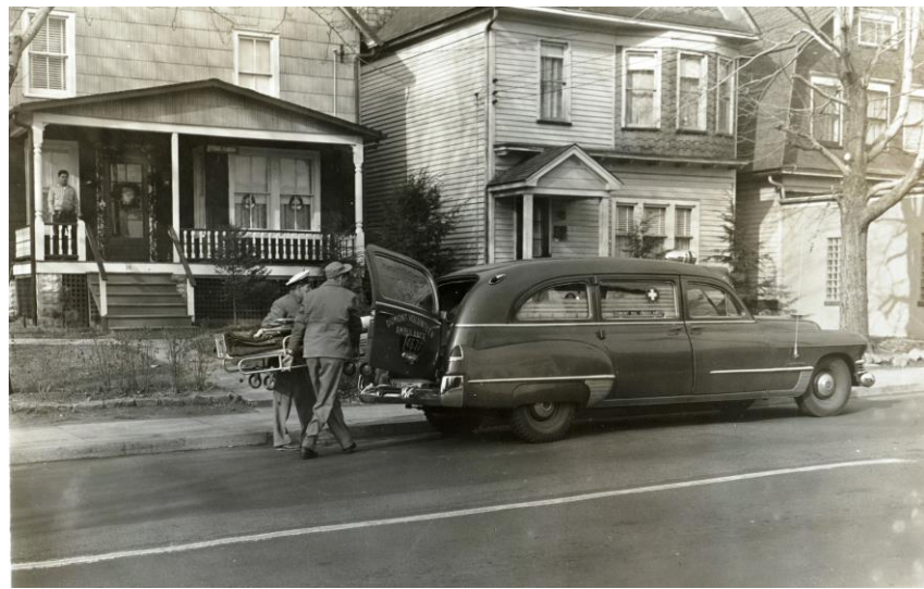
In July 1949 the Corps purchased its third ambulance, a new Cadillac Superior with Hydra-Matic Drive that was Ivory Green outside and two-tone gray inside. Donations from a door-to-door fund drive in Dumont covered the $7,214 price.