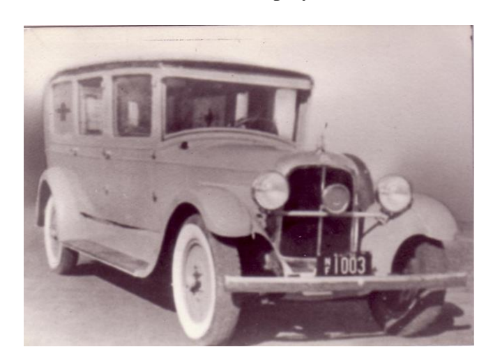
1927 Studebaker ambulance, the first rig of the Dumont Ambulance Corps served for 3 years answering 275 calls and was then sold for $1 to a neighboring town.

Using donations from supporters and the members' own funds, the DVAC purchased a used 1927 Studebaker Ambulance that was previously owned by Bergen Pines County Hospital in Paramus NJ. After refurbishing the rig, the Dumont Ambulance Corps went into service in August 1938. Over the next 43 years the Corps owned and operated 7 car-type ambulances. Photos of each of those vehicles survive and are displayed below.