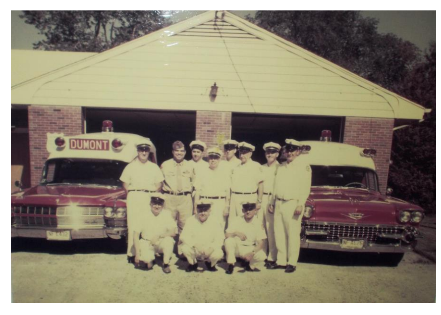
The 5<sup>th</sup> ambulance purchased by the DVAC was a 1964 Cadillac Eureka with a list price of $18,000 although the final purchase price was much less. In this time period the Corps had also built a new building and a Memorial Day photo shows both the 1958 and 1964 Cadillacs on the apron with some Corps members before a parade.