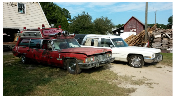
Wellsboro car out of the weeds and ready for the future