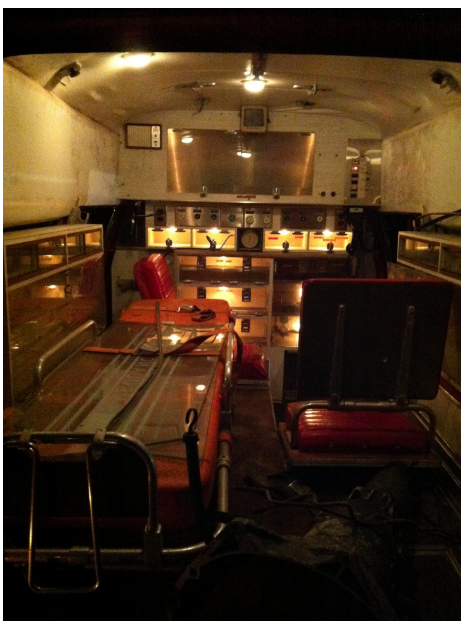
Interior of Wellsboro Ambulance with lights working again

Now that is a real ambulance rescue and we will one day see it on the show field at a future PCS International Meet, thanks to Darryl Thompson.