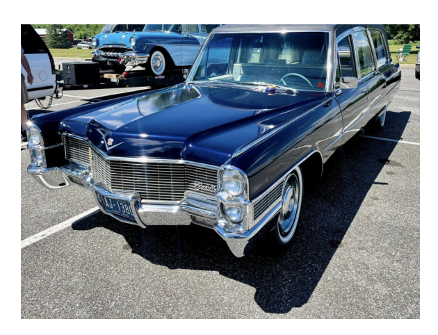
Brian Martin's 1965 Superior Combination