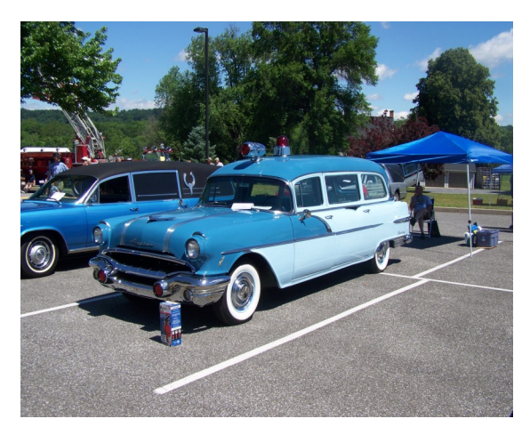
Charles Lambert's recently restored 1956 Superior Pontiac