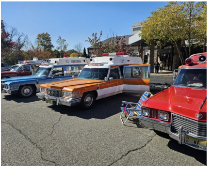
Ambulances on display at the EMS Council of NJ Convention