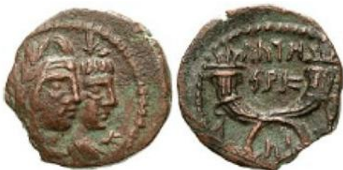
Aretas IV with wife Shuqailat behind/cornucopias 9BC-40AD, note the script in Aramaic, the language of Jesus.

Don't forget that Jesus was born at 7BC or 4BC to take into account all the personages mentioned at his birth (Herod died 4-1 BC, Emperor Augustus 14BC-37AD, Governor Quirinius 6-12AD), which was how time was kept back then, e.g. about the 7th year of emperor, king, governor so and so. Herod and Quirinius were not there at the same time. Likely Quirinius was taking the census roles for taxes ordered by previous governor as every governor did every ten years or so. They were there to collect taxes for Rome. Our year 0 was a pretty good medieval guess. Comets for the star of Bethlehem noted by Chinese astronomers make 7BC or 4BC the favored dates.