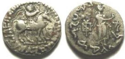
Azes II, A.II mounted / Athena stands, 35BC-4AD

There are about a dozen contenders for the magi or wisemen at Jesus' birth. There were many petty kings around the Holy Land, but we want them to be ones that issued coins. Coin contenders for the Three Wisemen: Azes II of the Indo-Scythians, Phraates IV of the Parthians, Gondophares of the Indo-Parthian (whom St. Thomas is said to have converted to Christianity) and Aretas IV of the Nabataeans: