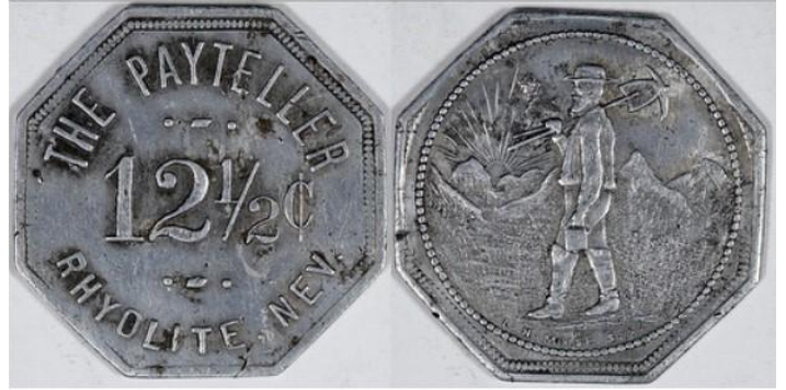
Lot 3535. The Payteller Token