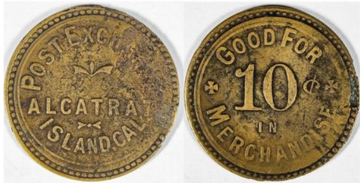
Alcatraz Post Exchange Token

A 1971D Jefferson nickel double struck on a dime blank: