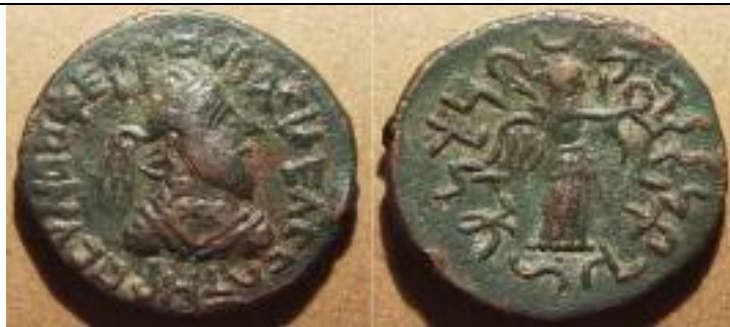
Gondophares, bust right / Nike stands, 10BC-50AD