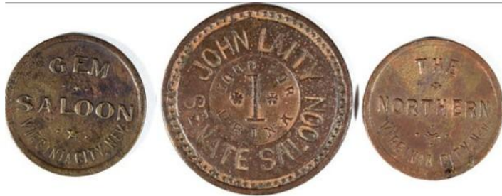
Lot 3577. Virginia City Saloon Tokens