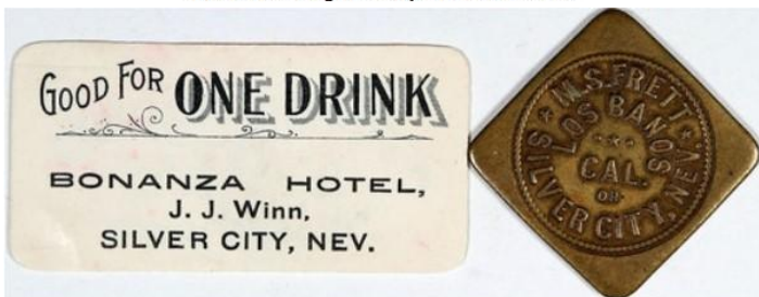
Lot 3554. Bonanza Hotel - M.S. Frett Tokens, Silver City, NV