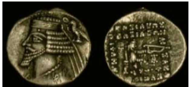
Phraates IV, head left / king as archer, 37-2BC