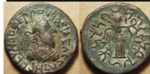
Gondophares, 10bc-50ad bust/Nike stands