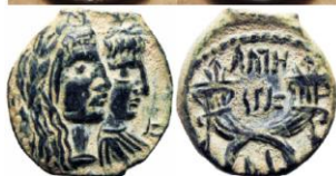
Aretas IV 9bc-40ad wife Shuqailat/ cornucopias

The coins for the Three Wisemen have traditionally been: Azes II of the Indo-Scythians, Phraates IV of the Parthians, Gondophares of the Indo-Parthians (whom St. Thomas is said to have converted to Christianity) or Aretas IV of the Nabataeans. There were many other petty kings of the East that did not issue coins. Tigranes V of Armenia, the first Christian nation should be a candidate. Rulers were often priest kings like the Roman emperors, who were Pontif Maximus, chief priest. Astronomy (with astrology) and medicine (role of diet and exercise) were a part of