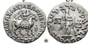
Azes II, 35bc-4ad A. II mounted/Athena stands

eclipse on April 17 was when Jupiter was “in the east,” a condition mentioned twice in the biblical account about the Star of Bethlehem. In August of that year Jupiter became stationary and then “went before” through Aries where it became stationary again on Dec. 19 (my birthday!), 6 BC. This is when the regal planet “stood over,” a secondary royal portent also described in the Bible. A Roman astronomer confirms that the conditions of April 17, 6 BC, were believed to herald the birth of a divine, immortal, and omnipotent person born under the sign of the Jews. Both Augustus and Silanus, who was governor of Syria from AD 13 to AD 17, commemorated the event with a bronze coin. Indeed, every subsequent Roman governor of Syria for 200 years issued a coin heralding the celestial event as Providential promise of their elevation to a world throne. Octavian (Augustus) did become Roman emperor, but so did Elagabalus, priest king of Emesa, Syria in 218 AD. Two 19 year olds miraculously became emperor, which became a proof of the validity of astrology for the Romans and Greeks.