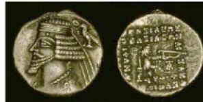
Phraates IV, 37-2bc head/ king as archer