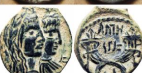
Aretas IV 9bc-40ad wife Shuqailat/ cornucopias

The coins for the Three Wisemen have traditionally been: Azes II of the Indo-Scythians, Phraates IV of the Parthians, Gondophares of the Indo-Parthians (whom St. Thomas is said to have converted to Christianity) or Aretas IV of the Nabataeans. There were many other petty kings of the East that did not issue coins. Tigranes V of Armenia, the first Christian nation should be a candidate. Rulers were often priest kings like the Roman emperors, who were Pontif Maximus, chief priest. Astronomy (with astrology)