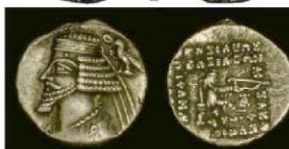
Phraates IV, 37-2bc head/ king as archer