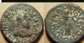
Gondophares, 10bc-50ad bust/Nike stands