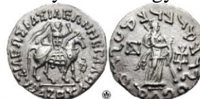
Azes II, 35bc-4ad A. II mounted/Athena stands