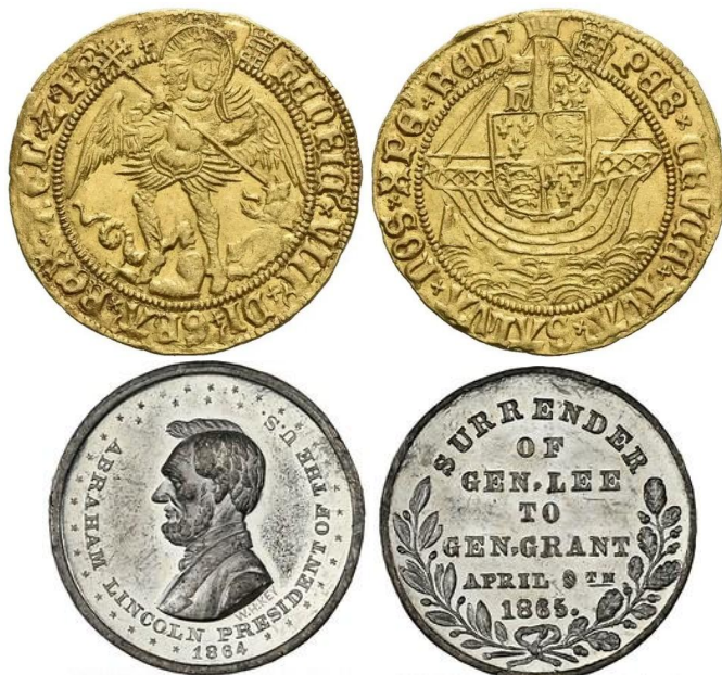
An interesting 1865 political campaign medal, a

couple working in their garden, adjusting a fence post near their flower bed found 70 coins mostly large gold coins from the time of Henry VIII. Most of them were in stunning condition dating from the 1420s through the 1530s. The hoard is now expected to sell for over $300,000.