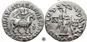
Azes II, 35bc-4ad A. II mounted/Athena stands

nation should be a candidate. Rulers were often priest kings like the Roman emperors, who were Pontif Maximus, chief priests. Astronomy (with astrology)