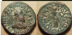
Gondophares, 10bc-50ad bust/Nike stands