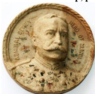
1899 Washington DC souvenir of Admiral Dewey,