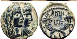
Aretas IV 9bc-40ad wife Shugailat/ cornucopias