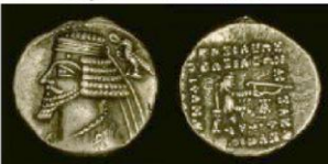
Phraates IV, 37-2bc head/ king as archer