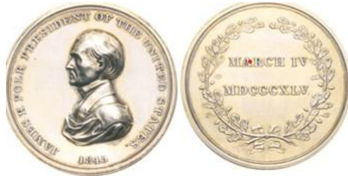
James Polk's Inaugural Medal

The inaugurations of Presidents Adams, Madison and Monroe were without any recorded medallic commemoratives, but Jefferson and John Q. Adams had fine medals struck privately, followed by Martin Van Buren, John Tyler, James K. Polk and Zachary Taylor who minted a curious series of four similar medals, all struck by the U.S. Mint. All used for the obverse, the medium size Indian peace medal die for the respective President.