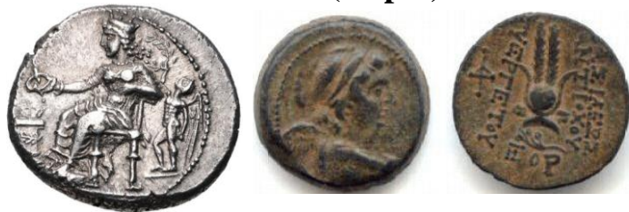
Nagidos 4 th BC Aphrodite before altar//Eros behind Antiochus VII 2 nd BC Eros//Isis headdress

Reno Coin Show July 18 th and 19 th at the J (Sands)