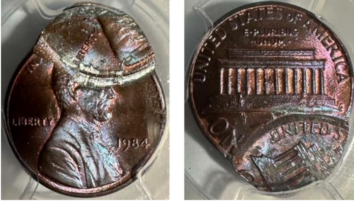
Double struck 1984 P MS66 by a doubled die. Unique.