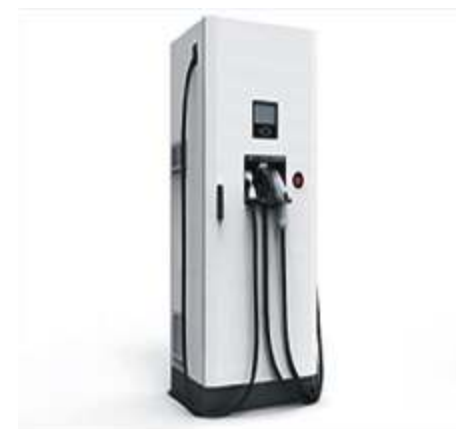
E-Vehicle Charging Solutions