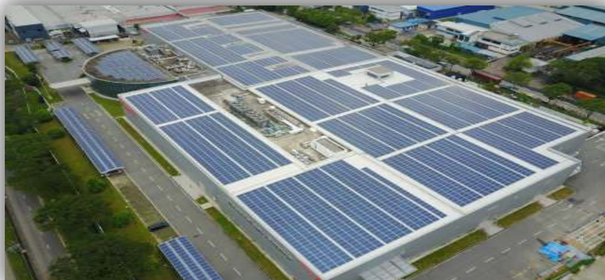
Solar Roof Top & Ground Mount for Residential, Commercial & Industries