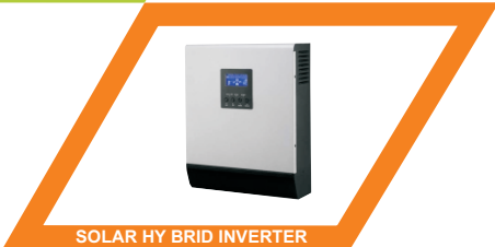
SOLAR HY BRID INVERTER