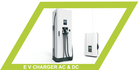
E V CHARGER AC & DC