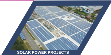
SOLAR POWER PROJECTS