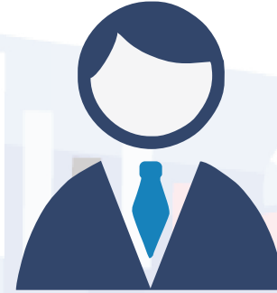
Director - Supply Chain Management BYJU P