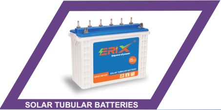
SOLAR TUBULAR BATTERIES