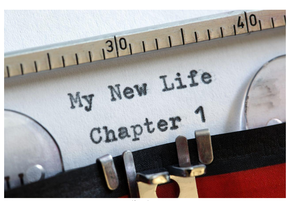
April's Blog # 2 Finding Routines in the New Norm

Without a doubt every single person in the United States is facing the same challenge of being stuck at home and dealing with the reality that previous routines no longer exist and these same busy routines have halted to a slow and "not business as usual" process. The positive routines that are vital to ensuring productivity to assume our purpose and value in society, as they make us work towards reaching an optimum goal productivity level at the highest level.