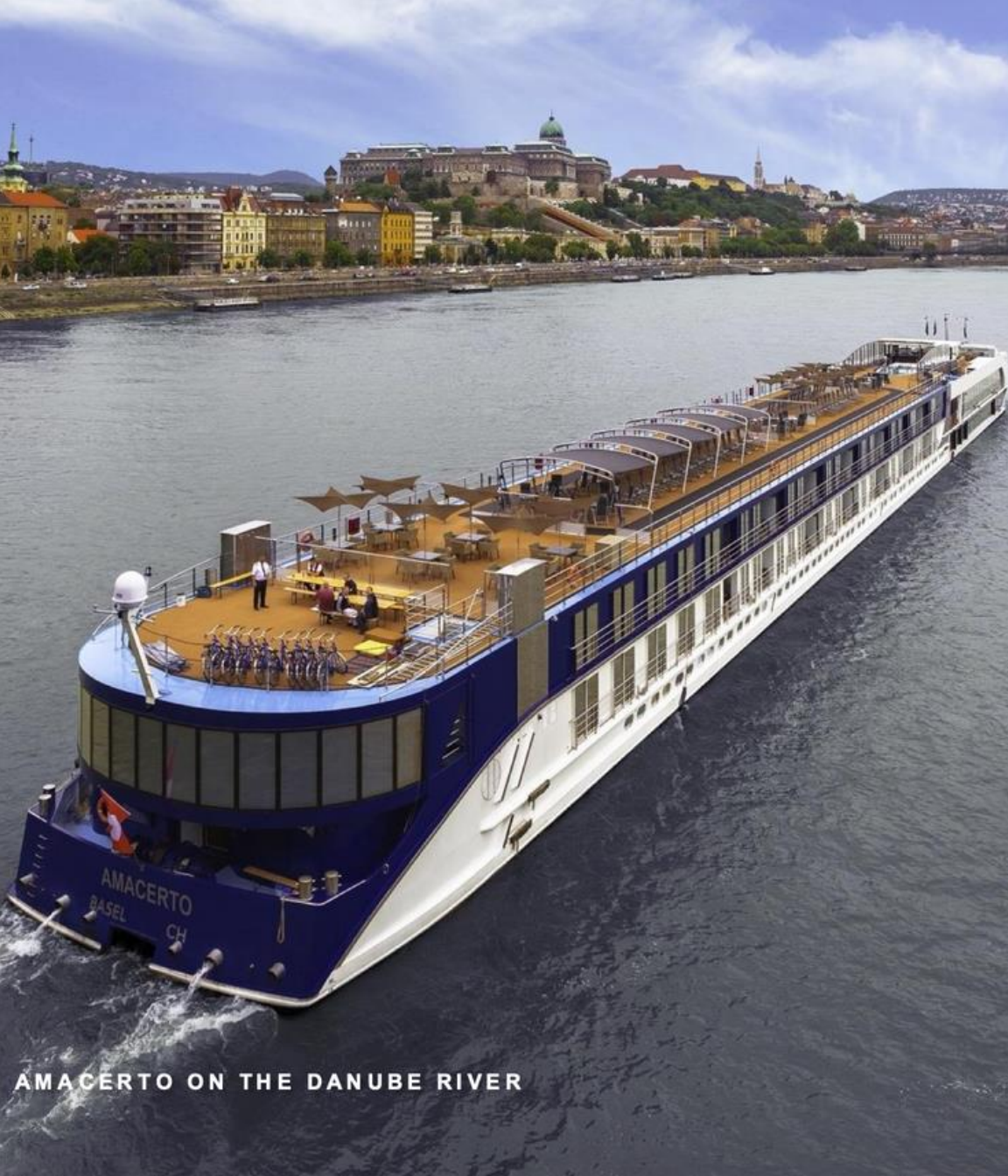
AMACERTO ON THE DANUBE RIVER