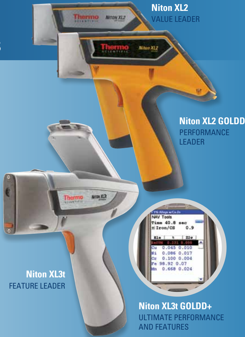
Niton XL2 VALUE LEADER