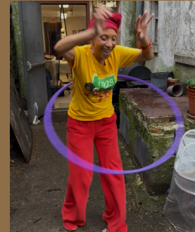
Hula Hoop Games top off the day with movement and fun!

2025 marks 31 years of cancer survivorship for me. It was delightful to celebrate survivorship in an artful way with family, friends and neighbors.