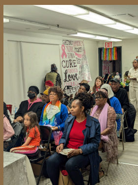
Participants learn to make tasty plant-based treats.