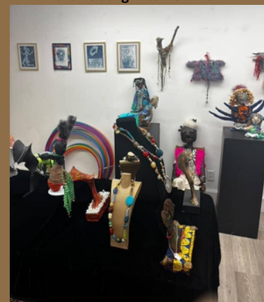
Art Exhibition Showcase of creativity by Open Your Eyes (O.Y.E.) Artist Participants