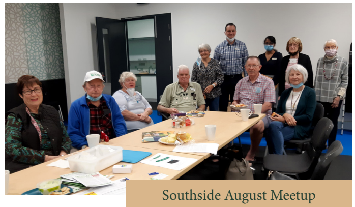
Southside August Meetup