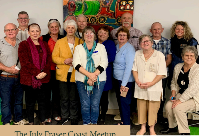
The July Fraser Coast Meetup

Our Fraser Coast members were overjoyed to once again attend our regular monthly meet ups in February this year. It was with great pleasure that I welcomed back regular attendees and 4 new attendees.