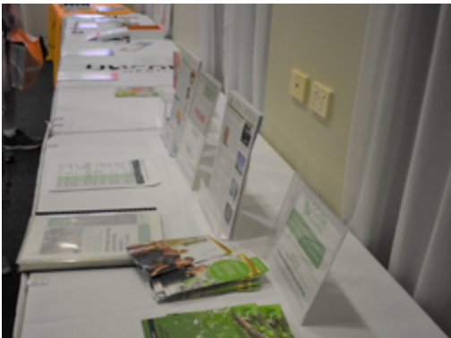
Product Information display