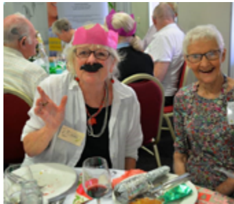
Two attendees hamming it up!