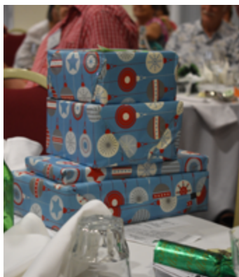
Serial raffle winner spoils!