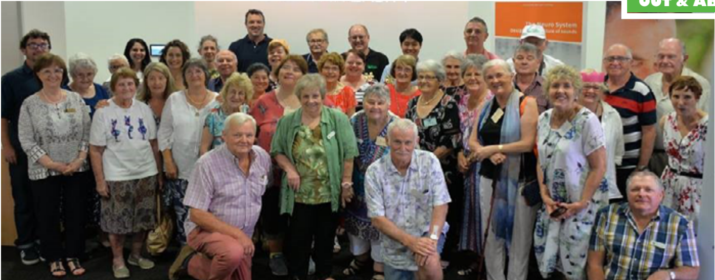
Christmas Function 2018