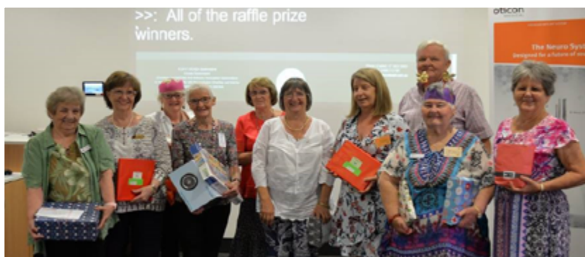
All the 2018 Raffle winners!