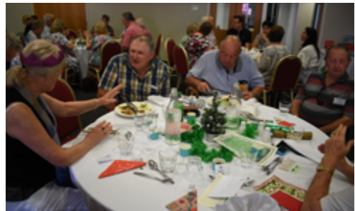
A sumptuous feast and conversation enjoyed by all!