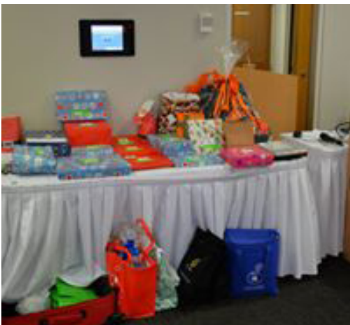
Raffle prizes display