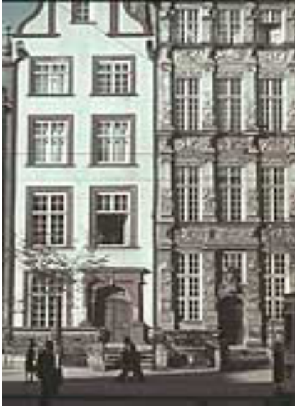
The Steffens House, now called the Golden House, in The Lange Market, Danzig