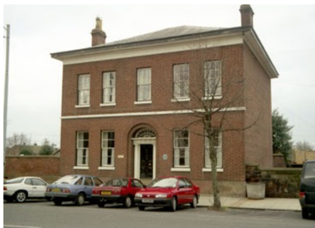
FDN1946 c.1990 Ashley House, Main Street, Frodsham