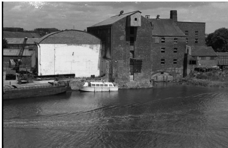
FDN 1749 Sutton Mills c. 1940

The old, smaller mill was retained. A newspaper report In November 1804 described a fire that destroyed the extensive water corn-mills and thousands of measures of corn belonging to different persons and that these mills were the property of Sir Peter Warburton of Arley Hall . Fortunately the mills were insured and were rebuilt.