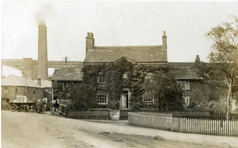
FDX0141 Mill House, Sutton Mills c.1900

The old, smaller mill was retained. A newspaper report In November 1804 described a fire that destroyed the extensive water corn-mills and thousands of measures of corn belonging to different persons and that these mills were the property of Sir Peter Warburton of Arley Hall . Fortunately the mills were insured and were rebuilt.