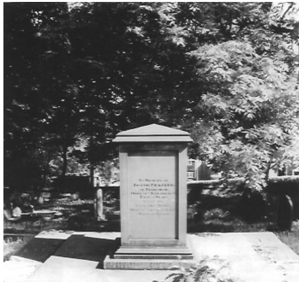
Pickering family grave, Parish Church of St Laurence