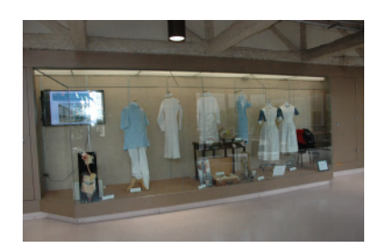
Student Uniforms at WGH HSC over the Years

Did you know .... our Alumni data base has a total of <u>7.256</u> members and 2,178 of these are Life Members which means they have paid for a life membership and/or have graduated 50 or more years ago.