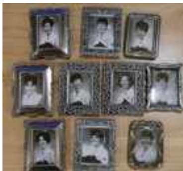
Pictures of members of jubilee class of '69, “gone but not forgotten”