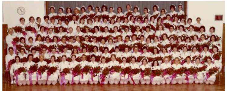
Submitted by Jan Westmacott, class rep.

It is with a sense of pride that we approach our 50 th anniversary and reunion, with the anticipation of following the Piper into the banquet room.