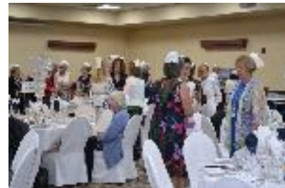
Class of 1974 celebrating their Jubilee year wearing caps plus a few wore uniforms at the Homecoming Dinner!