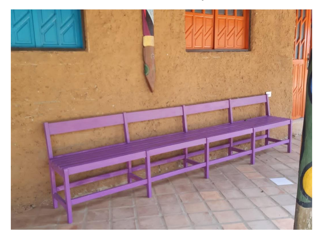
Mud Hewn Nature Block