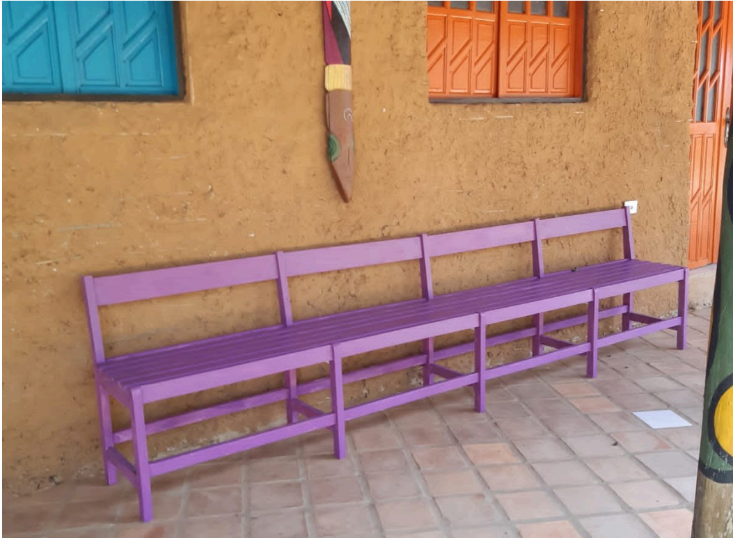
Mud Hewn Nature Block

The accommodations at Eco Parque Da Mata are humble and natural dwellings. The block is constructed of red clay mud and the block is hand built by locals in the area. Each room has its own private bathroom equipped with a shower, toilet and sink. The eco park sits in 80 thousand square meters of Native Atlantic Forest and is full green and vibrant energy everywhere! The group has our own private kitchen and dining area, in addition to serene environment equipped with hammocks for relaxation.