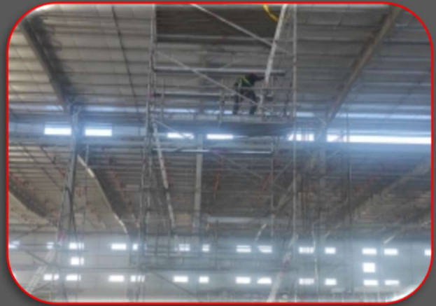
Supply of scaffolding materials for the Bridgestone Factory