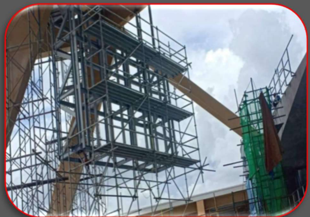
Supply of scaffolding materials and manpower for the 2019 South East Asian Games