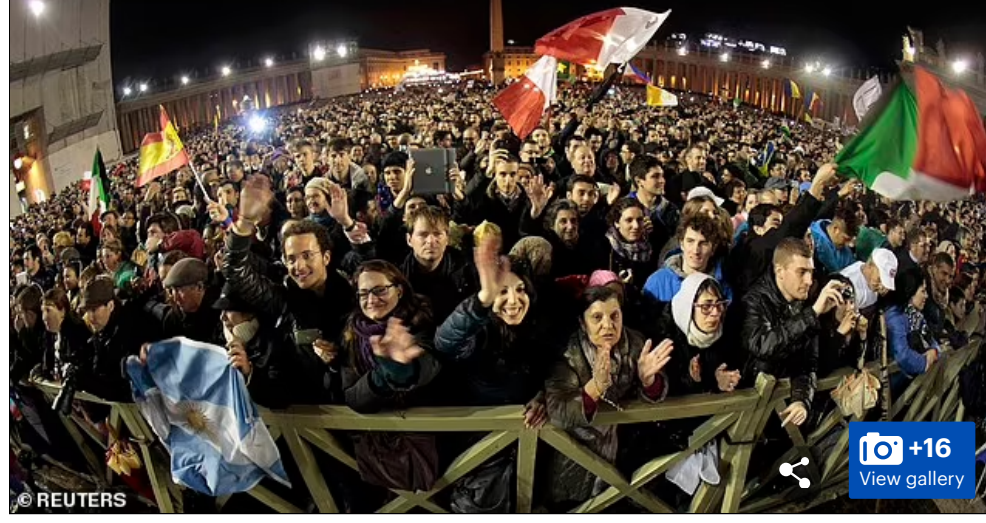
Evident delight of the crowd at St Peter's Square, Vatican as the faithful cheer him as their newly elected leader

The 223 page book, which will cost £20 on Amazon, is described on the website as: 'An extraordinary personal and historical journey, Life is the story of a man and a world in dramatic change.