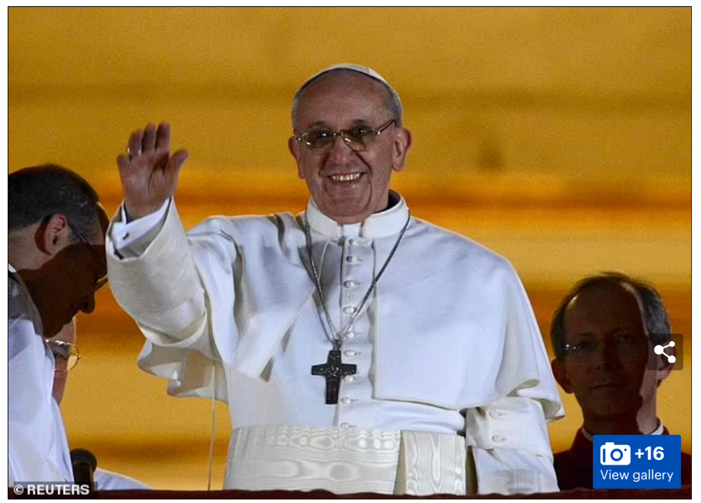
Pope Francis appearing on the balcony of St. Peter's Basilica after being elected by the conclave of cardinals, at the Vatican, March 13, 2013

that sooner or later, perhaps after a stay in the hospital, I might make an announcement of that kind, but there is no risk of it: Thanks be to God, I enjoy good health, and as I have said, there are many projects to bring to fruition, God willing.'