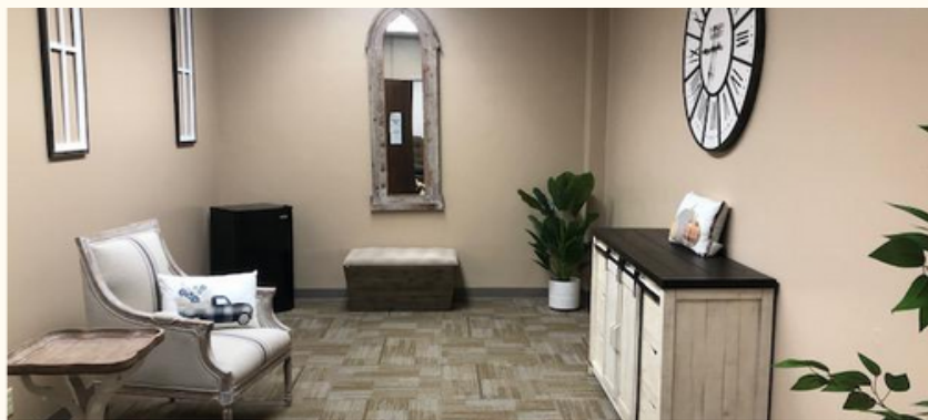
This image depicts the Abilene City Hall Lactation Lounge

The [Insert name of responsible party] will monitor organization leadership and employee adherence to this policy on a [Insert timeline] basis.