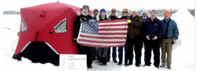
Some of our Ops (L to R): KDØIPI, KEØQQN, KEØQQM, AAØU, KØGW, KØAIF, NØDRX, WØGAF, WØOXB

Members of the Stillwater, Minnesota Amateur Radio Association (SARA) operated a portable station on a frozen lake in east-central Minnesota (~10 miles east of St. Paul). Having strong Scandinavian heritage, Minnesotans have been known to do crazy things to break the monotony of the long winters. (Some say hams do crazy things too!) This was our sixth consecutive year for this craziness!