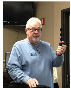
Go Box Presentation (See Page 7)

Send your articles / photographs to: aro.kg5vis@gmail.com