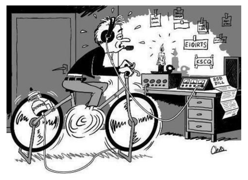
"Sorry OM, I can only work QRP at the moment!"