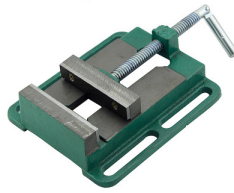
Small Heavy Vise