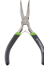
Small Needle Nose

Now that we have gathered our tools and items and before we start let us look at this video I found that covers the beginning basics and some good tips on solders and even some de soldering.