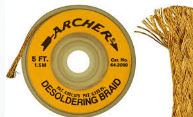
De Soldering Braid

Squeeze Bulb that pulls melted solder into the inside of the bulb when pressure is release. Suction tool which has plunger. When spring is push down and latch a release button is engaged. When push spring returns to normal pulling the melted solder up into its chamber. Desoldering braid (which is best for cleaning circuit boards), when heated and place onto the solder connection it pulls the solder into the mat of the braid.