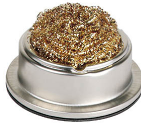
Copper Brillo Pad