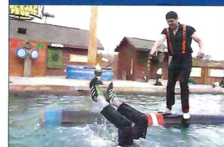
PAULA DEEN'S LUMBERJACK FEUD SHOW