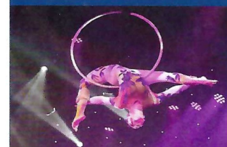
"ARRAY" - Pigeon Forge's Newest Variety Show

Diamond Tours inc. Bringing Group Travel to a Higher Standard®