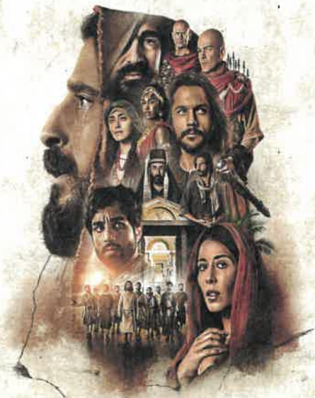
THE CHOSEN SEASON FOUR

If you are new to The Chosen and have not seen Seasons 1-3. There are lots of ways to view them. You can download the Angel Studios app, watch on Peacock, Netflix, Amazon Prime, ect. The church does have the DVD of Season Three.