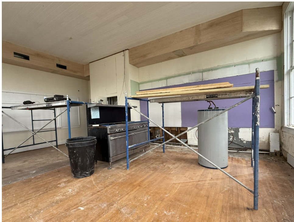
The vintage commercial stove stands in the center of the historic school-house's kitchen. Framed by scaffolding and stripped walls, the quiet space pauses in mid-transformation as modern renovations breathe new life into the space.