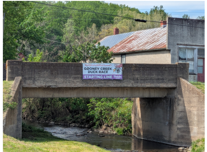
The banner hanging from the bridge marks the starting line of the Gooney Creek Duck Race at April's annual Redbud Festival.