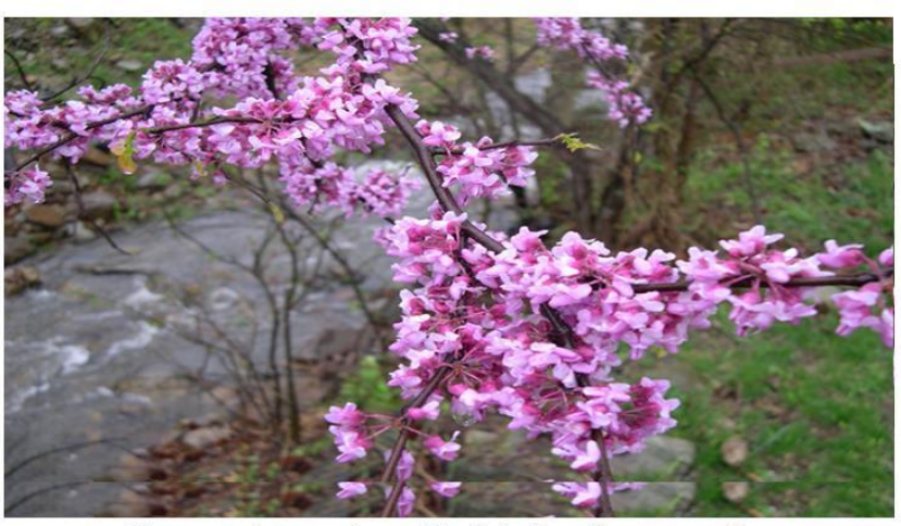
Saturday, April 26th 9a.m.-3 p.m.