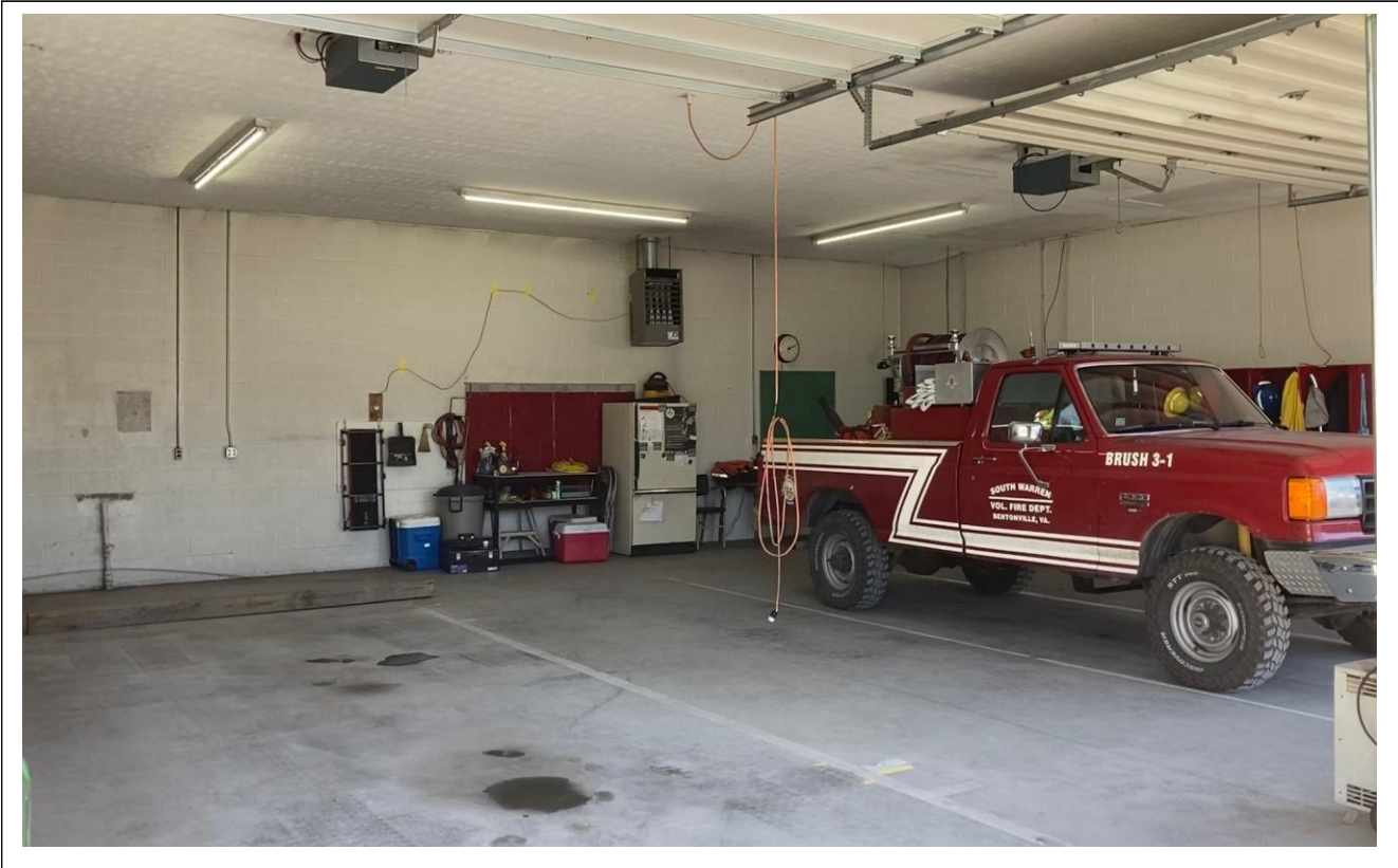
WHAT'S WRONG WITH THIS PICTURE?