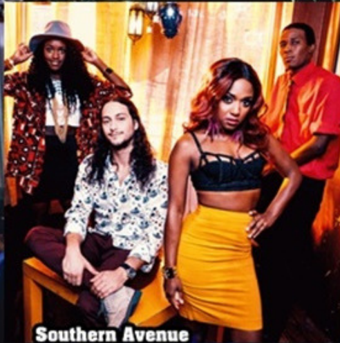
Southern Avenue August 23