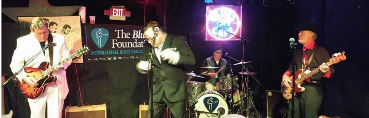
House Rockin' Good Time Jump Rhythm & Blues!! Guaranteed to entertain!!

Free for CBS Members – only $5 for non-Members