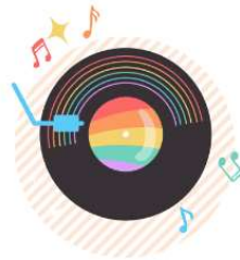
Support Live Music Keep the Blues Alive