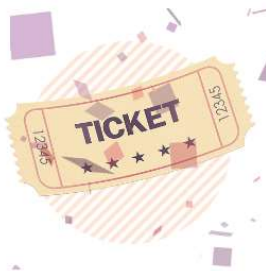
Concert Ticket Drawing May 2