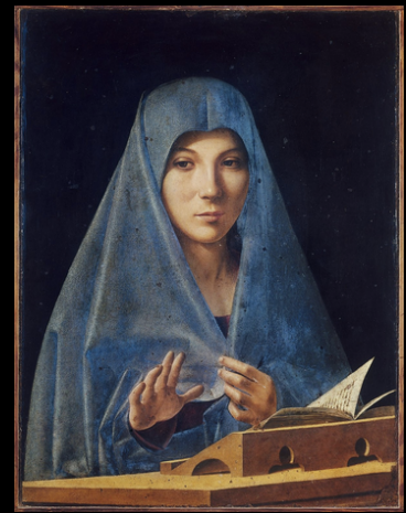
Virgin Annunciate by Antonello da Messina

A meditation on the Virgin Mary's place in the Catholic church and maternal grief.