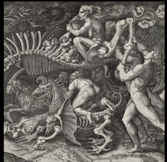
Lo Stregozzo by Agostino Veneziano