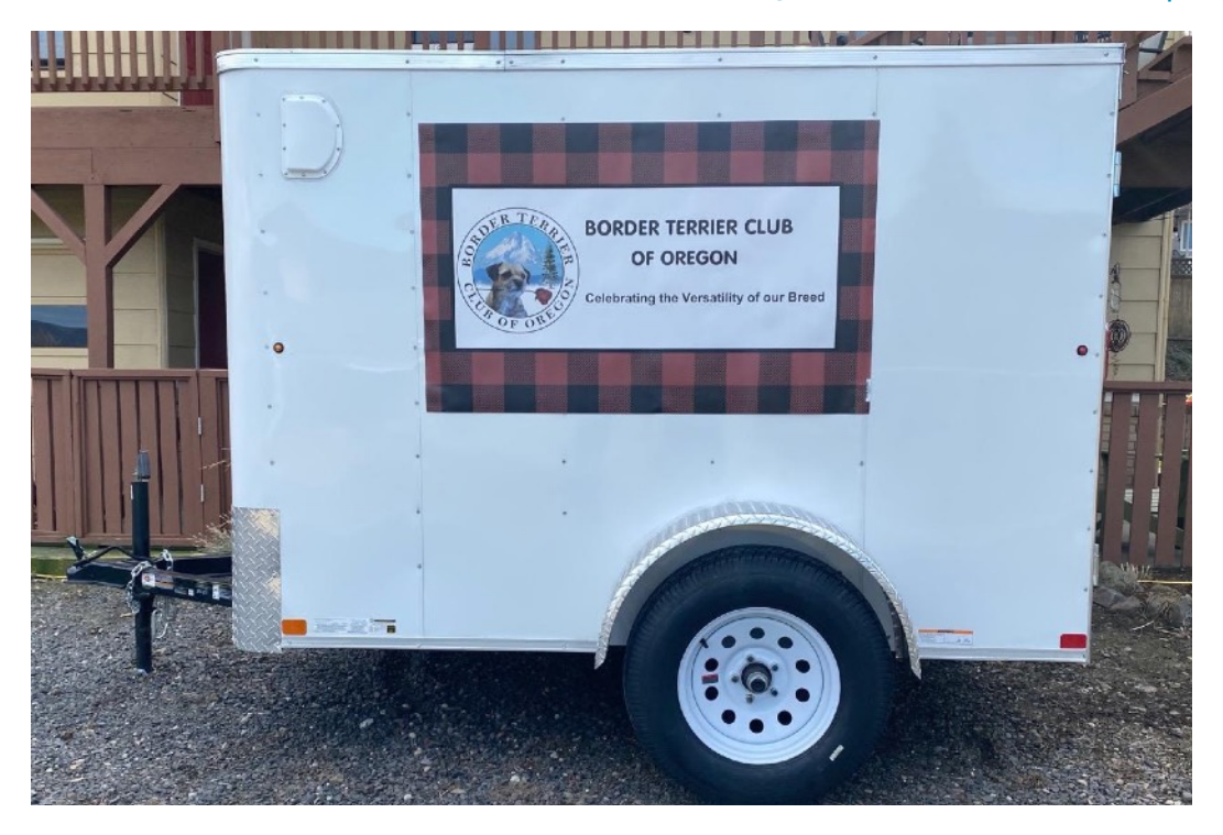
We must be official now......we purchased our own club cargo trailer! Let the fun and activities begin!!