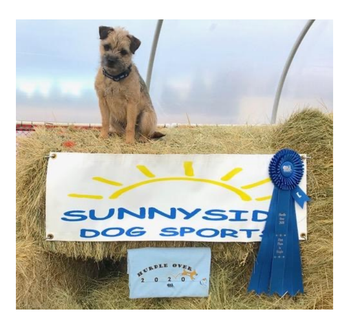
Vercse had a very successful Barn Hunt season, especially with the new Hurdles event.