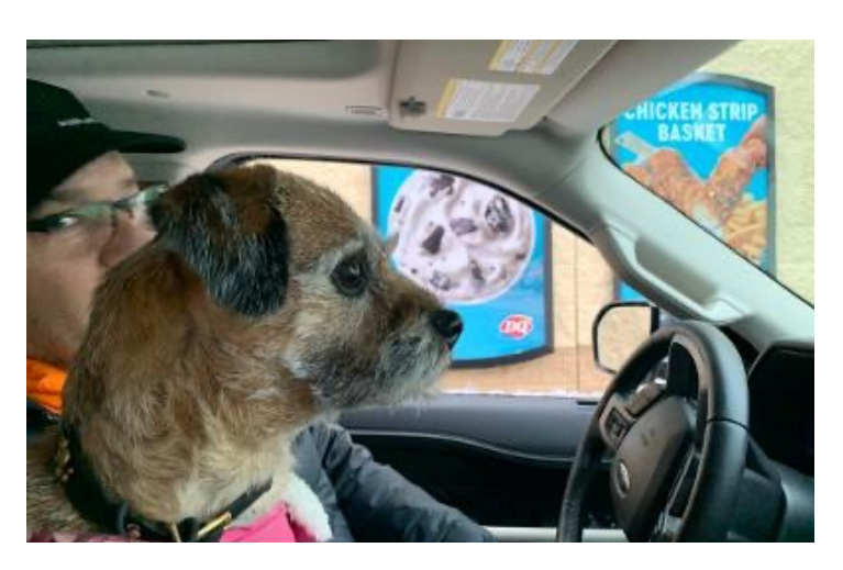
Remi is patiently waiting for her turn to order with Dad at DQ.