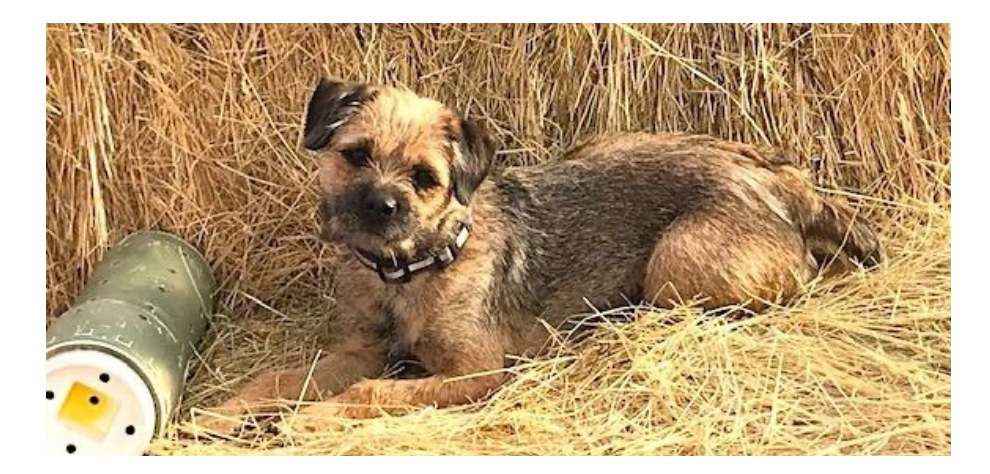
Bryn can't wait for rat events to start again!