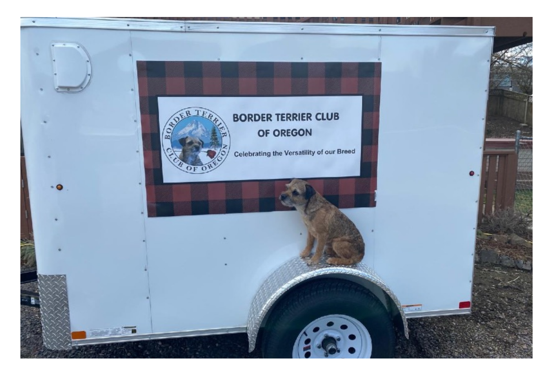
Turbo is ready to put some Earth Dog equipment into our new BTCO club cargo trailer. His mom Casey is just ready to get all of the club supplies out of her whelping room and stored in the trailer!