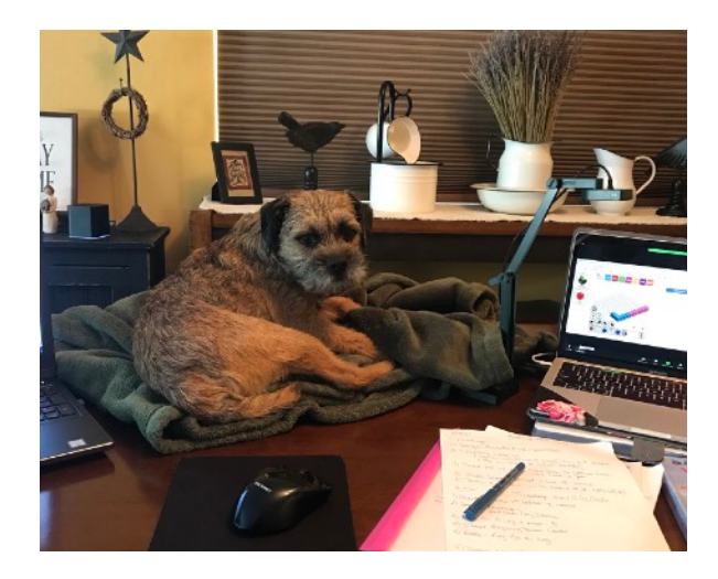
Ozzy says if I can't help teach on Zoom school today, then I'll just make myself a comfy napping spot right here instead.