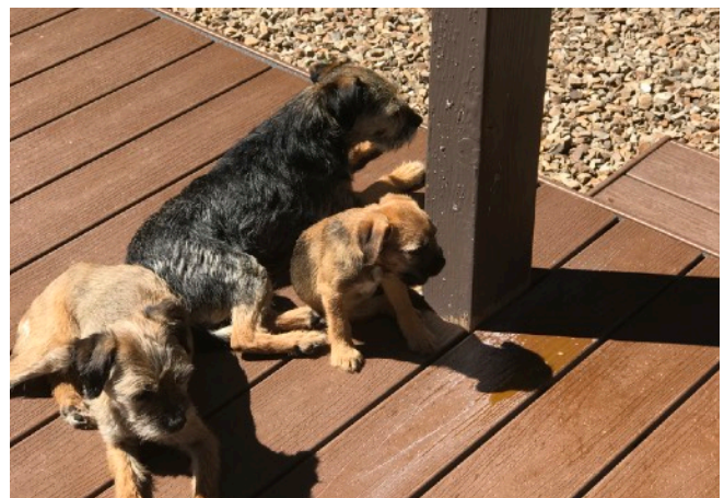
Uh-oh...is that a tiny puppy among the pack?!