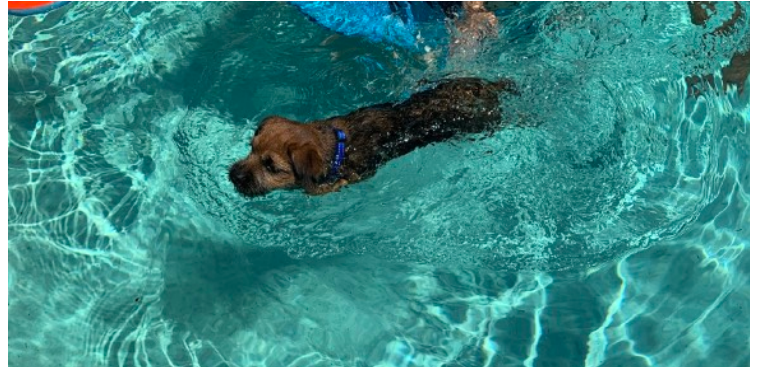
Ledger is learning the ropes in the pool.