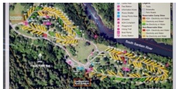
Waterloo County Park map of our picnic area.

All picnic and auction attendees must sign a Waiver of Liability and Informed Consent COVID-19 Waiver releasing the club and it's members from all liability.