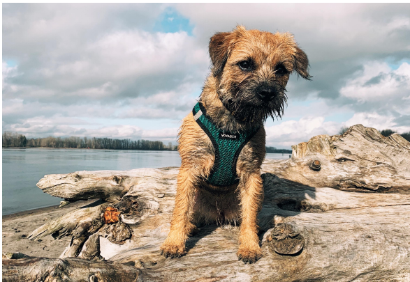
The spunky Ellie

What is the greatest gift or most positive experience you've had because of Border Terriers or your life in the dog world in general?: The love and companionship this little pup brings to our home. We have never had a dog that has the personality of Ellie, she is such a little darling brat face that we couldn't imagine not having her. She's soooo smart, she's a whiney little baby but that's just how she talks to us, she hugs us constantly and loves to be rocked while you dance around the house with her. She is so much fun.