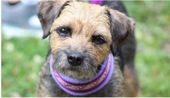
CH Tilted Kilt Blues After Midnight THDN, CGC, CGCU, ATT - "Lilypad", "LP", or "Paddycakes"