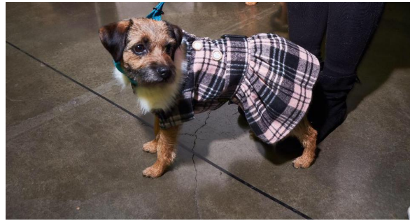
The Diva at the Rose City Classic in January 2020