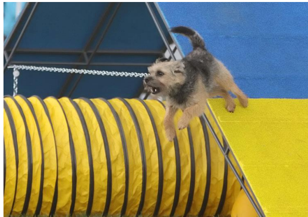
Make contact and go!!!