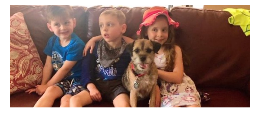
.....and when they get bigger!