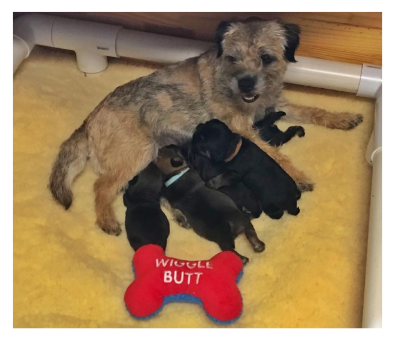
Shadowhill's newest litter at 14 days old: Jason (GCH Shadowhills No Fooling) X Karma (CH Shadowhills Written in the Stars).

Casey: The days of performing spay/neuter surgeries at 6 months of age are no longer the norm. Much research has been done on the negative effects early sterilization surgeries have on a dog. The absence of hormones interfere with proper bone growth that affect conformation, leading to a variety of orthopedic issues. I highly recommend waiting as long as possible, allowing for growth plates to close before proceeding with surgery. I ask my puppy buyers to wait until at least 12-18 months of age.