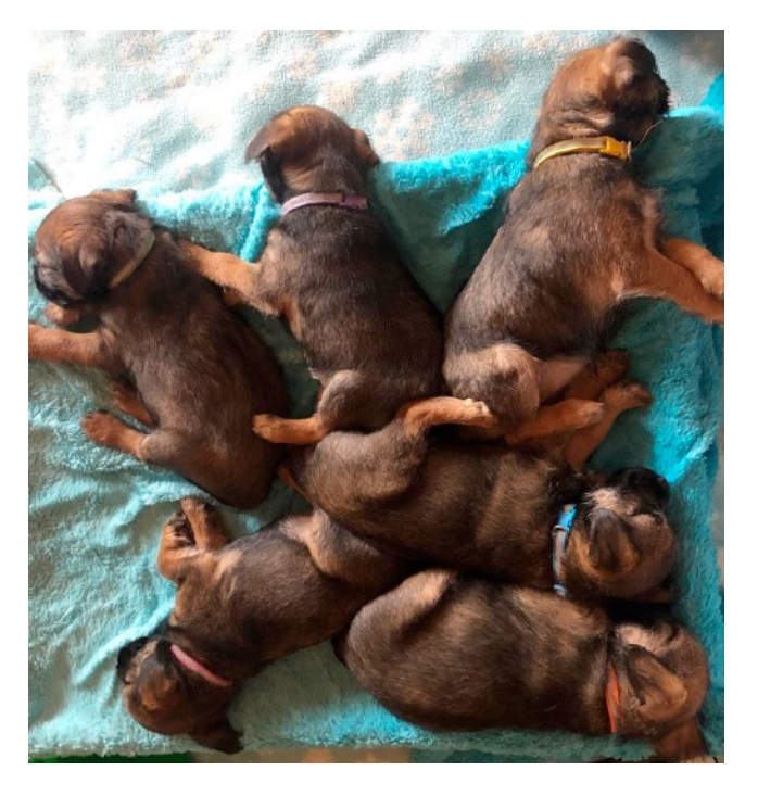
Caleb Campbell's pile of puppies! The Apple Litter: CH Kittle-Bee's Man in Tan Tweed "Tweed" X CH McHill's Moody Blue "Moody".