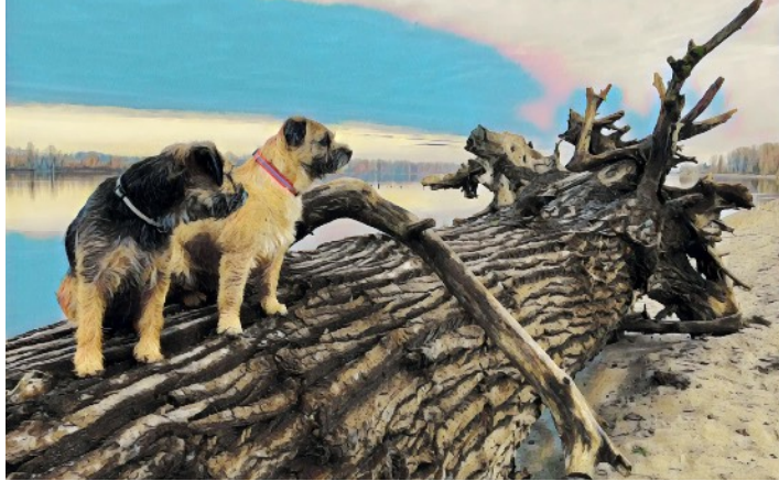
Odin and Ollie socially isolated at the beach.