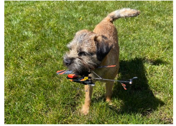
Burt says BTs can catch more than just rats!