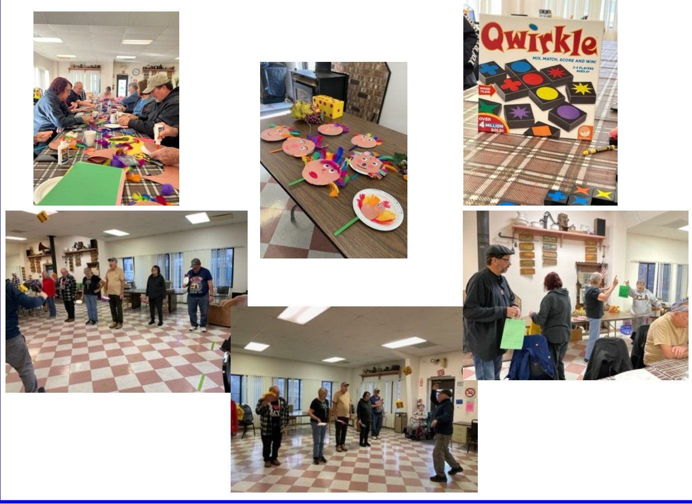
The Ramblin' Road 8 1

In November, 2022 they had their final camp out at one of their favorite locations, Duck Island in Rio Vista, CA. While there, they indulged in their favorite past times of eating, games, talking, and sharing ideas on the world at large. Here are some pictures of that final camp out. Please enjoy!