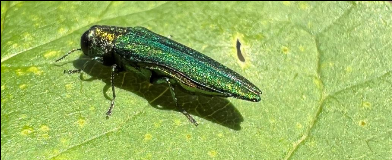
Emerald Ash Borer (EAB): A threat to Oregon's ash trees