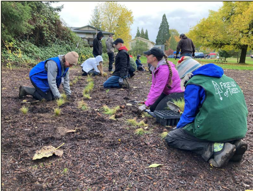
Friends of Trees event Nov 2022