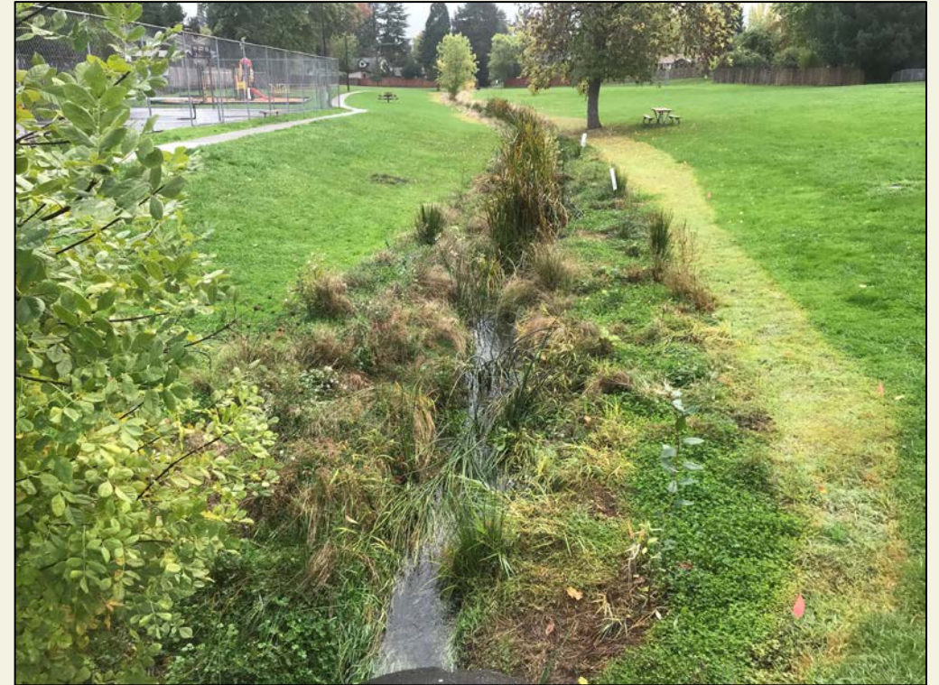
Facing south from Deline St