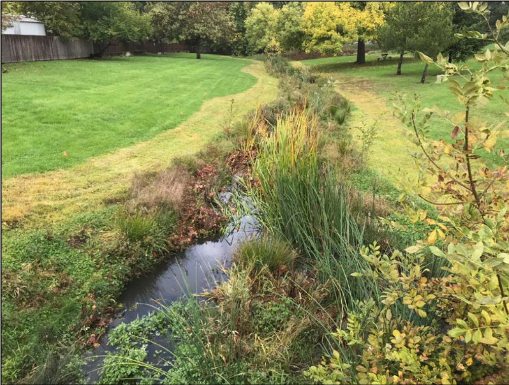
Facing north from Deline St